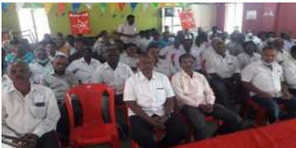
Dharmapuri District Conference held on 17.02.2021