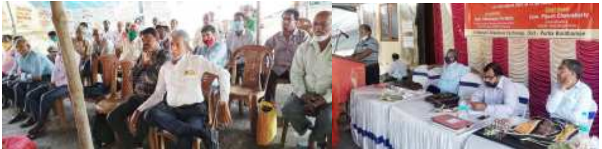
Burdwan District Convention held on 14.03.2021.