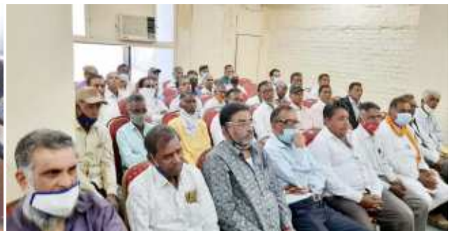
Godhra District Branch formed on 21.02.2021