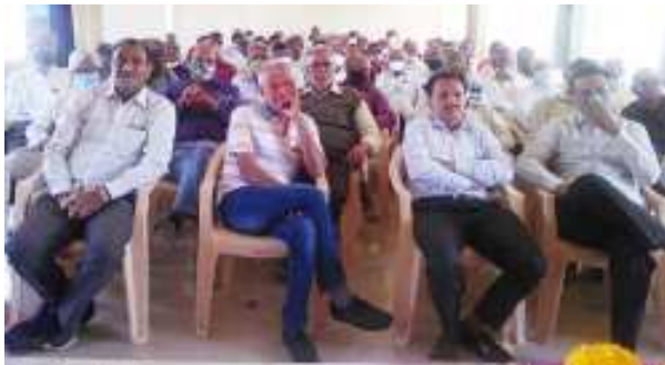
Himatnagar District Branch formed on 07.02.2021