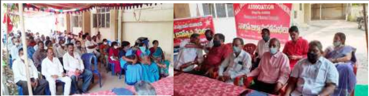
District Conference of Khammam and 20th Anniversary of BSNLEU held jointly on 22.03.2021