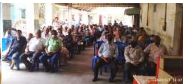
District Conference of Asansol, West Bengal held on 07-03-2021 .